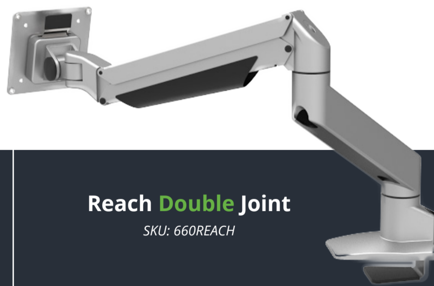
Reach Double Joint