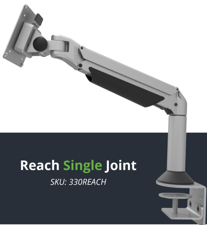
Reach Single Joint

Base easily clamps on to any surface; click-on mount design so tablet can be easily removed or carried