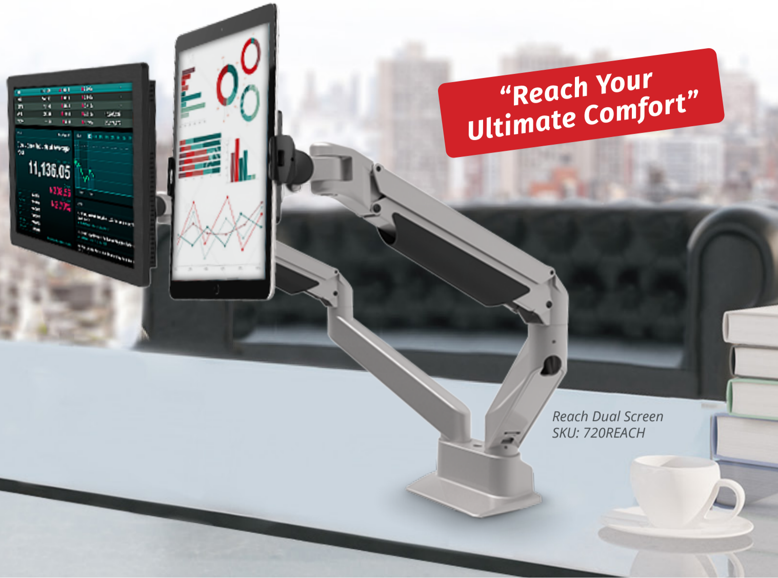
Reach Dual Screen SKU: 720REACH